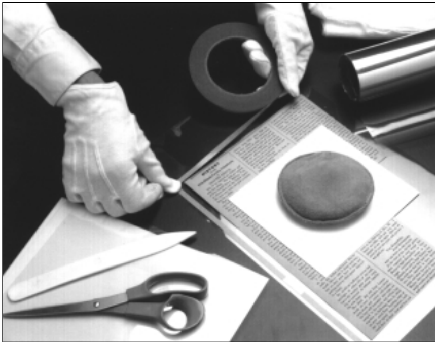
Minnesota Historical Society photo by Eric Mortenson.

3M double-stick tape is being applied to the polyester film (Mylar D or Melinex #516), leaving a 1/4" margin from the document. Gloves help prevent fingerprints from marking the film. Note that a weight has been placed on a clean sheet to hold the document in place.