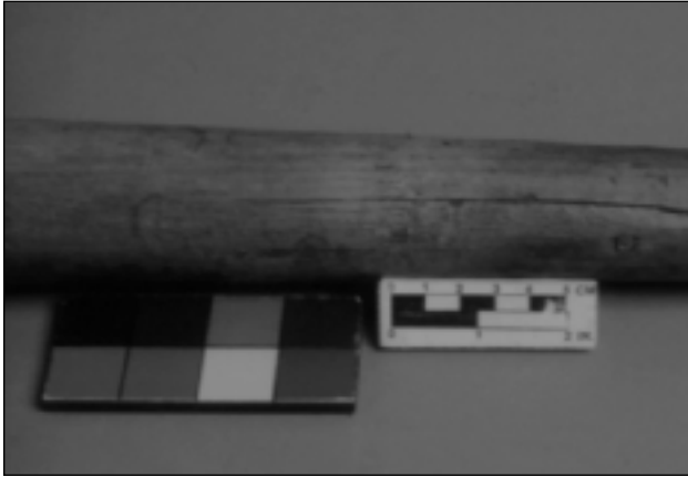
After removal of tape residue on the bat (photo previous page), this crack was not repaired or filled.

Plastics include high-impact polystyrene and high-density polyethylene and polypropylene. Plastics are affected by long-term exposure to light and heat. They can be particularly affected if the quality of the plastic was poor when it was manufactured. There is not much that can be done for an item or material that is subject to “inherent vice,”—its natural tendency to deteriorate—other than proper handling and stable storage conditions.