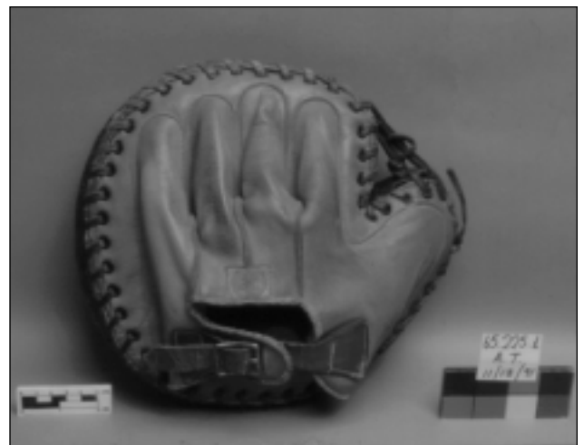
Leather baseball mitt, excellent condition. The interior was supported with inert polyethylene foam strips.

A condition that might be encountered in late 19th-century equipment is called "red-rot." This is caused by excessive acidity in the leather, and is evidenced by