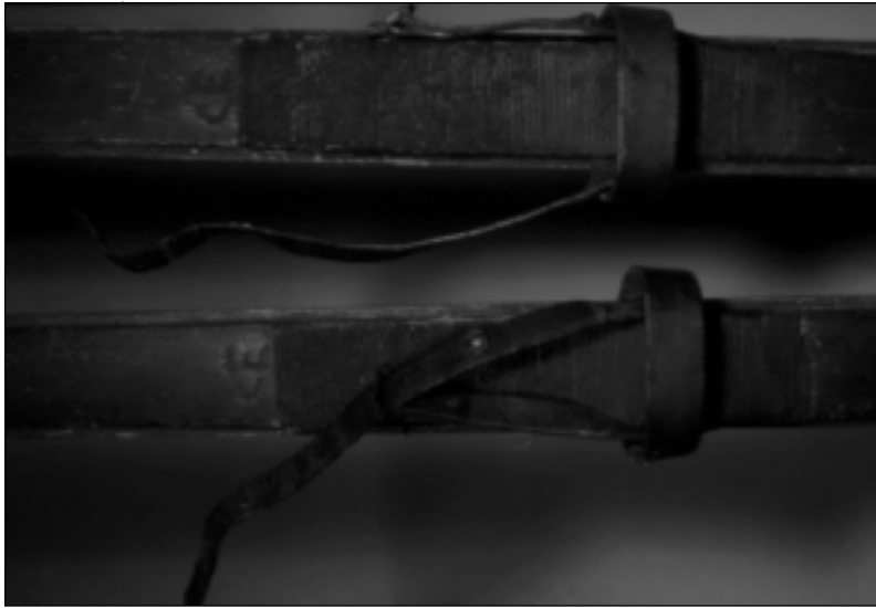
Wooden skis, showing thick vegetable-tanned leather straps.

loss of the grain layer (smooth surface), a reddish-orange color, powdering of the exposed surfaces, and darkening in contact with water. Leathers in this condition must be handled very carefully or irreversible damage will occur.