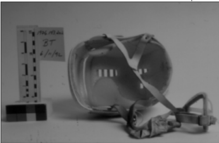
Hockey helmet, donated by former Governor Wendell Anderson, who wore it while playing amateur hockey. The adhesive tape was left on the chin strap as evidence of use.